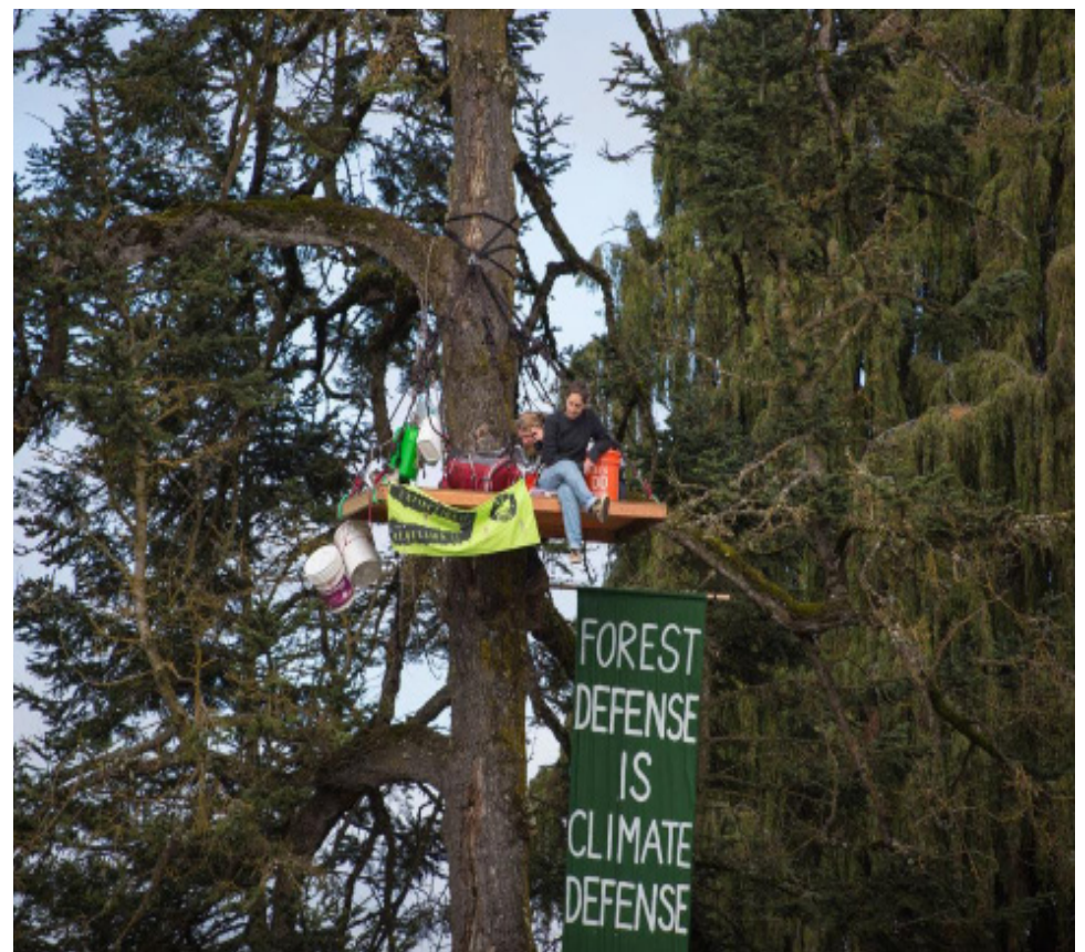
photo of Thurston Hill tree sit

With a new school year starting, Femme Militia demands the shut down of Taylor’s Bar & Grill for the safety of UO students and other patrons, as well as a form of retroactive decency for the survivors who have and haven’t come forward.