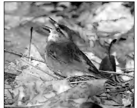
Highlight of the weekend: Swainson's Warbler.