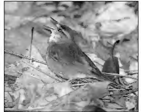
Highlight of the weekend: Swainson's Warbler.